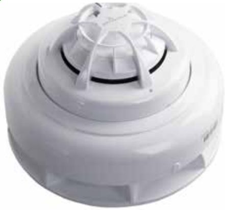
XPA-CB-14019-APO XPander Combined Sounder and Multisensor Detector