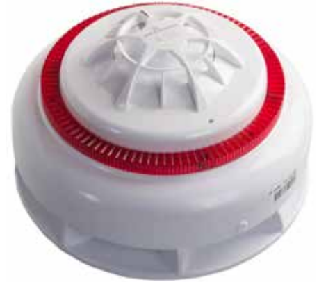
XPA-CB-14021-APO Combined Sounder Visual Indicator (Red) and Heat Smoke Detector