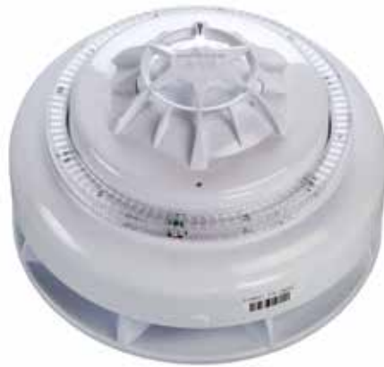
XPA-CB-14025-APO XPander Combined Sounder Visual Indicator (Clear) and Heat Detector (Class A1R)